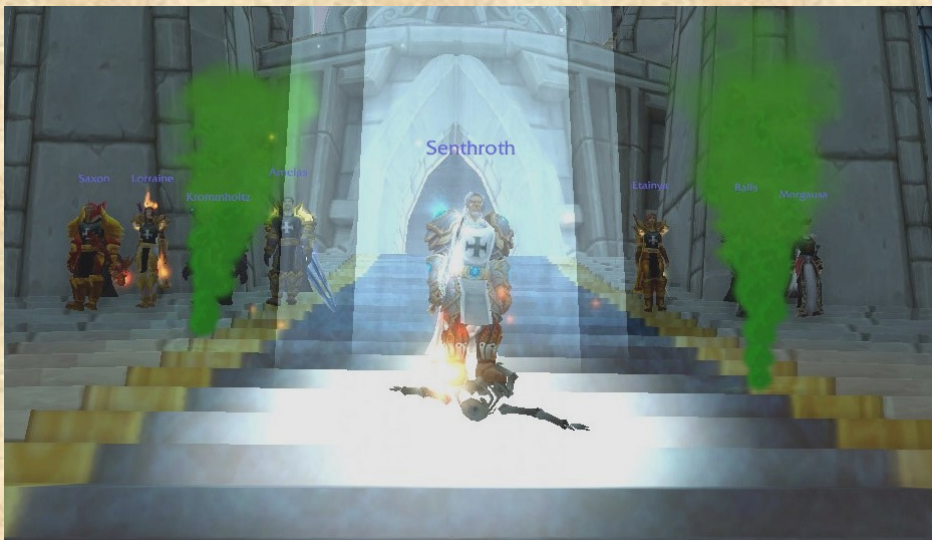
The moment of Transfiguration. His mortal body can be seen at his feet.

For years, he has been known for wearing a black leather book case with gold thread adorning the trim on his right hip, looped onto his belt.