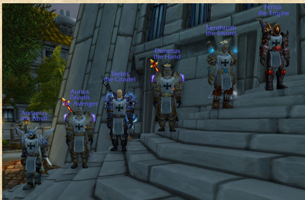
Above, we see six of the seven Immortals in a rare moment, gathered together at an assembly of the Order on the Cathedral steps. (Excepting Father Grimhurst)

His moniker comes from the fact that he is the Hand of the Light, being a corporeal incarnation of the Light's will, and directly performs the required tasks to ensure the Light's will is done. Also, the reliquary Grimhurst used as a focus for his Immortality was his hand, recovered from Andorhal when he died.